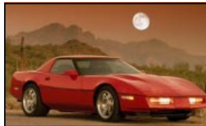
CELLPAGER™ protects you everywhere

-In parking lots or wide open places it may be very useful to Hear & Locate the vehicle. If because of the distance